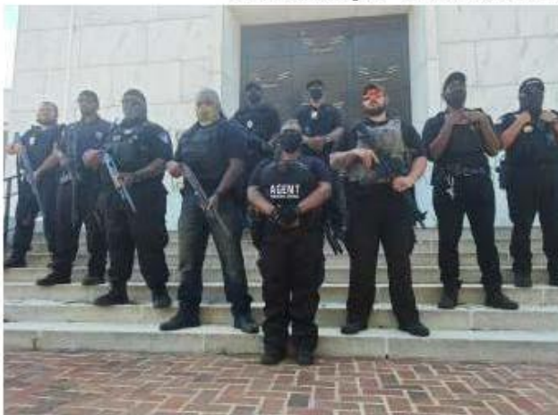
Security Guards presently protecting our building:

Be sure to put "UDC Restoration" in the For column.