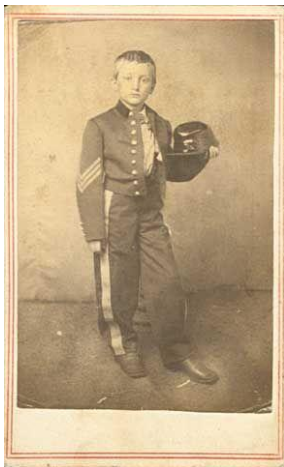
Johnny Clem - Union

Children and everyone's lives were impacted. Children served in the army as soldiers even though they were supposed to be age 18. Thousands of young boys from ages 13 to 17 fought in the war. Many were killed or wounded in battle. The youngest of the boy soldiers were messengers or drummers. Boys as young as age 10 are on record as serving drummers during the war. They served for communication on the battlefield. Different drum rolls signaled different commands like "retreat" or "attack". Those who served as messengers were usually fast runners who could bravely run important battle messages from one commander to another.