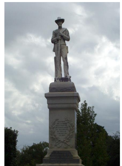
Oakwood Cemetery MMD 217 Confederate Memorial

Date: Sunday, April 25, 1954 Paper: Dallas Morning News (Dallas, Texas) Page: 13