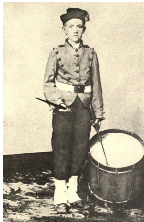
Charles F. Mosby - Confederacy