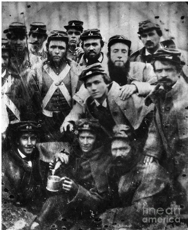
Photo: Confederate Soldiers, 1861

"A person dies twice: once when they take their final breath, and later, the last time their name is spoken." (Anonymous) Take time to "Say the names!" of your Confederate ancestors and their families in order to keep their memories alive.